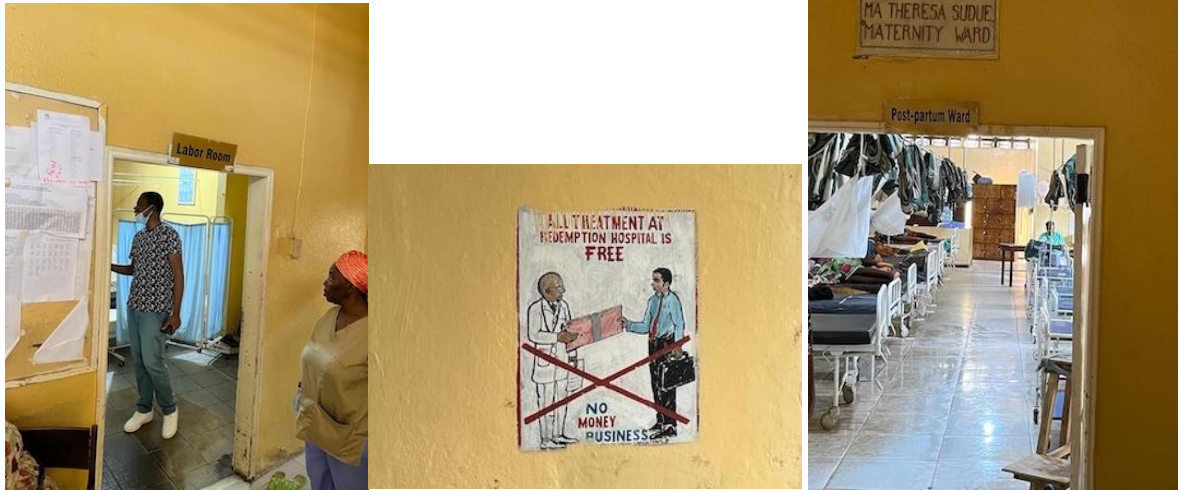
Short visit to the once functional government sector Redemption Hospital destroyed by the civil wars and then Ebola epidemic, with the Labor suite as the only functional part of the hospital