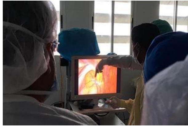
Basic Laparoscopy demonstration