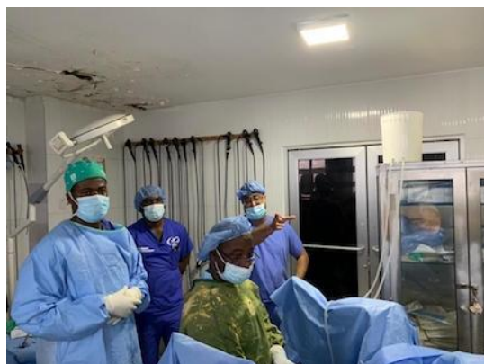
Endoscopic Procedures hands on training