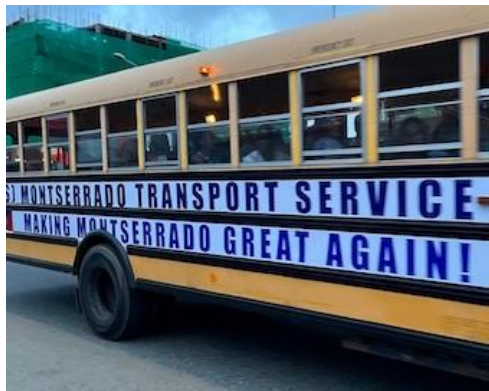
Somewhat fascinating glimpses of American influence as one drives across Monrovia