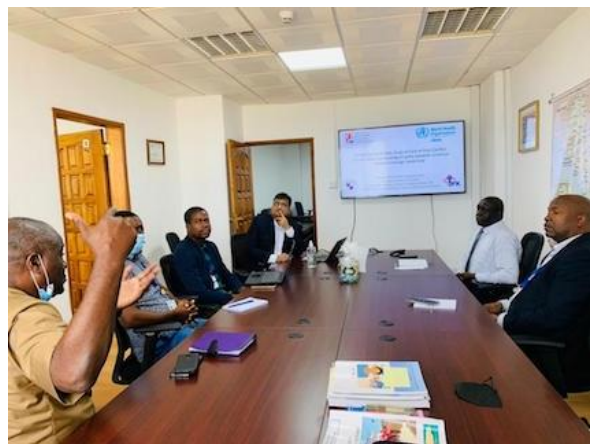
Visit to the UN headquarters and WHO country office to discuss healthcare system in Liberia Post civil war and how WHO can help to promote Surgical training