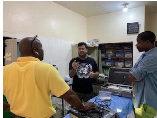
Pre-workshop equipment check