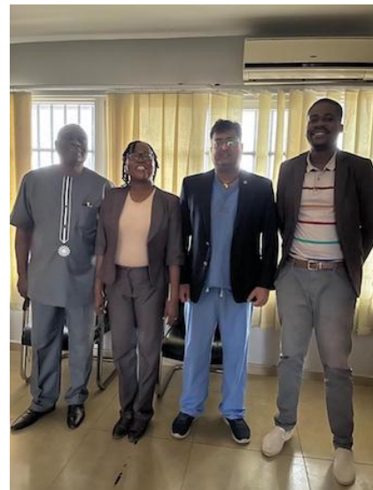
Meeting with the Health Minister, Liberia who offered full support to the hospital