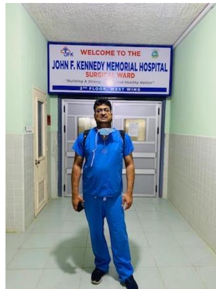
The newly refurbished Surgical floor, once Occupied by rebel forces as machine gun Outposts during wars !!