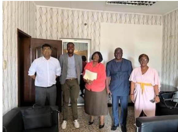
Meeting with Liberian College of Surgeons Team to support the training