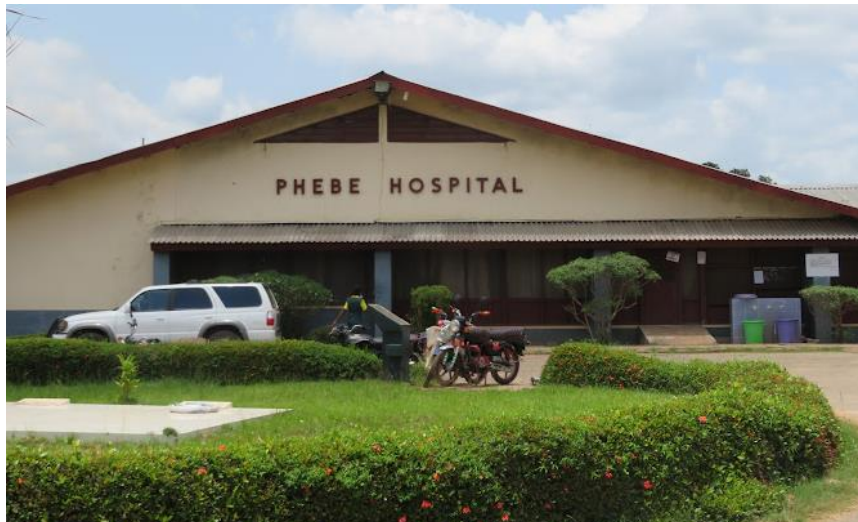
Phebe Hospital, Bong County Liberia. Preferred site for establishing a 2 nd urology unit